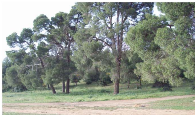
Figure 3: The vital space for Pinus halepensis in the subhumid bioclimatic stage in the forest of Nesmoth (Mascara), (January 2010).

In the area under study, the species of the arborescent stratum have in the semi-arid and sub-humid stage a living space o fluctuating between 28 and 201 m 2 as confirmed by Table 3, Figures 2 and 3.