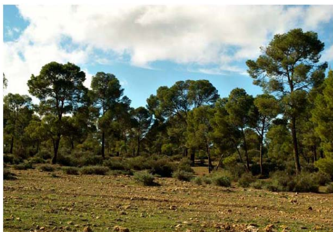
Figure 4: The vital space for Pinus halepensis in the semi-arid bioclimatic stage in the forest of Balloul (Saïda), (April 2011).

The exploitation of these results confirms the role of recovery rate for each stratum in the choice of living space allowing species to develop and adapt to environmental conditions. The living space of the few species studied remains high in the semi-arid bioclimatic stage, i.e., over 20% in average in relation to the sub-humid floor. These figures may be a reference to justify the choice of density in relation to environmental conditions in the study area for all development operations (planting, restocking and