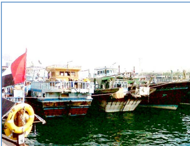
Figure 2: Dubai Creek crowded with Dhows carrying food stuffs from neighboring countries.

The need for animal or vegetable fats, oils and wax products in the food processing industries, as well as for domestic consumption, is significant. The UAE imports these from both regional and global suppliers. Staple cooking oils and fats, such as ghee and olive-oil, coconut palm and seed oil, can be obtained from a regional zone extending from the Mediterranean to the Indian Sub-Continent and East Africa, but may be obtained from more distant sources. The UAE also imports these from Malaysia, Argentina, and the USA. This accounts for approximately 80% of all such imports to the UAE.