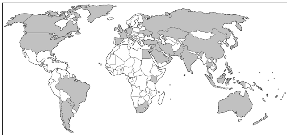
Figure 1: UAE main food imported countries in 2014.