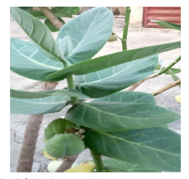
Plate 1: Calotropis procera plant.

The leaf of Calotropis procera contains an enzyme called calotropain, which induces cow or goat milk coagulation and on which milk production method is based [14]. The process of coagulation with the leaves of C. procera after heating, draining, and molding made the curd available on the market in different forms and sizes [15]. The leaf and latex of C. procera possess antimicrobial and antioxidant properties, which lend scientific credence for its use as natural agents in food preservation and pharmaceutical systems [10]. The nutritional and medicinal properties of the plant may be linked to both its nutrient and phytochemicals composition. Thus, both the leaves and seeds were characterized by some nutrient indicators.