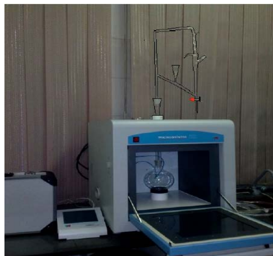
Figure 1: Adapted microwave distillation apparatus [6].

All the reported applications have shown that microwave-assisted extraction is an alternative to conventional techniques for such matrices [36]. The main benefits are decrease of extraction time and solvents used [36]. This extraction method which is by Microsynth (microwave extractor equipped with Clevenger-type apparatus) was used only once for E. platyloba (Figure 1 shows the apparatus) [6, 37]. Powdered sample in flask with water were mixed using a stirrer. The extraction was carried out at different extraction conditions [6]. The microwave vessel was irradiated at a 20 to 45 min and irradiation power (400 to 700 W), trapped in organic solvents, afterwards the essential oil was collected, dried under anhydrous sodium sulphate and stored at 0°C until analyzes [6, 38].